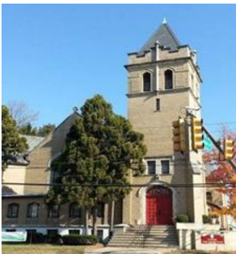
301 Chestnut Street, Roselle Park, NJ 07204